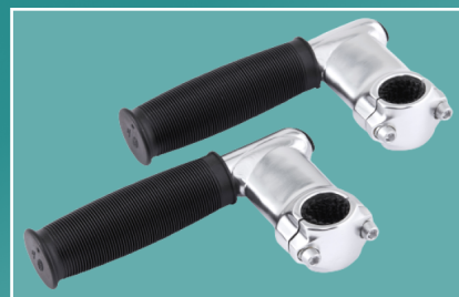
Tempo Handle Kit - THK01