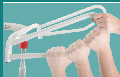
Multiple Grip Positions