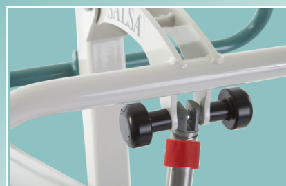
Knob Kit for Custom Sitting Sling - KK01

The Allegro Concepts range of patient lifting equipment including lifters, slings and accessories has been designed and tested to comply with: AS ISO 10535-2011 Hoists for the transfer of disabled persons – Requirements and test methods.